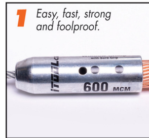
1 Strip the wire to allow full insertion into the head.